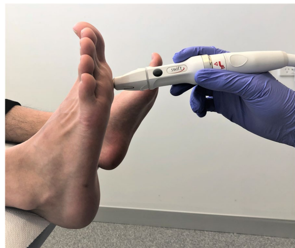
Fig. 1 Application of the microwave therapy applicator during a treatment session

Microwave therapy was delivered using the Swift® (Emblation Ltd., UK) device, which is a hand-held tool that produces microwave heat energy within the 8 GHz range. Podiatrists at the clinic completed the manufacturer standard training in using microwave therapy. The microwave energy was delivered directly to the infected tissue through a single use applicator tip to reduce the risk of cross-infection (Fig. 1). A standardised treatment procedure was followed for all patients. The first microwave therapy application at the first treatment session delivered 10 J using one application of 5W for 2 s. The wattage, frequency, and number of subsequent applications is determined by the level of pain tolerated by each patient. A 10-point scale was used at each appointment to collect patient-reported pain on arrival, during treatment, and on departure. Patients received a standard of three treatment sessions four weeks apart unless the lesion(s) resolved prior. A final review was undertaken at 12 weeks after the final treatment session where response to treatment was assessed by a podiatrist and recorded as either “resolved” or “unresolved”. Resolved lesions were defined as those no longer visible and where natural dermatoglyphics were restored. Before and after photographic evidence was used to support assessment. If unresolved at the 12-week review, patients were given the option continue further treatment sessions at 4 weeks apart until resolved, or to discontinue treatment.